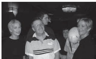
WPBA touring professionals graciously took time to meet with our participants who attended the event.

We have made every effort to ensure that this list is accurate and complete. We apologize for any omissions or errors.