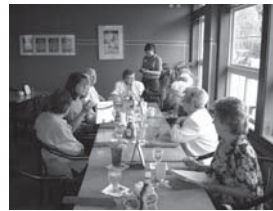
The Women of Parc exchange information, resources, and support.

The U of I Extension Master Gardeners hard work with the Parc Garden Project has been acknowledged by the State Master Gardeners association. They are recipients of the State Teamwork Award that will be presented on Friday, September 8, 2006 at The Mark in Moline, Illinois.